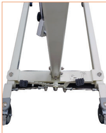
Adjustable base with foot pedal design allows the caregiver to open and close the base legs with minimum effort for transferring and positioning safely.