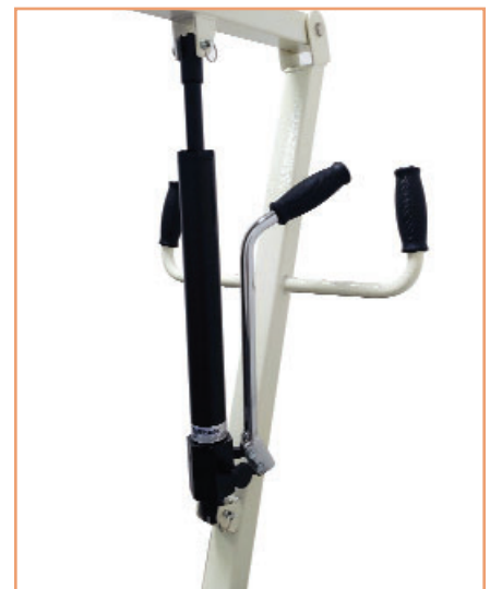
Quality hydraulic manual cylinder pump with a double o-ring seal for long lasting durability which allows to raise and lower individuals safely.